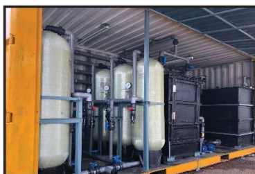
Potable Water Treatment