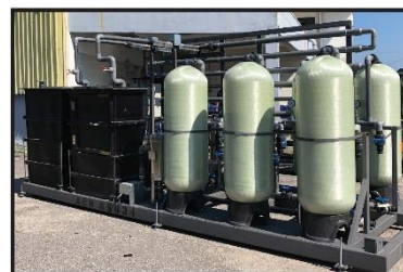
Industrial Water Treatment